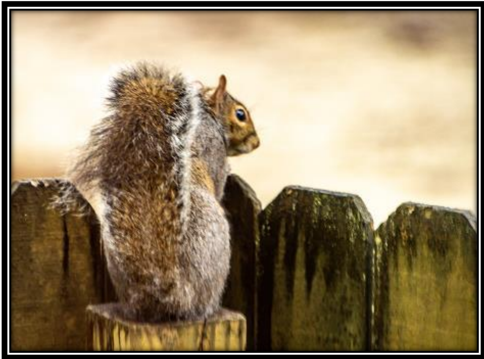
Open "Checking Out the Neighbor's Yard"