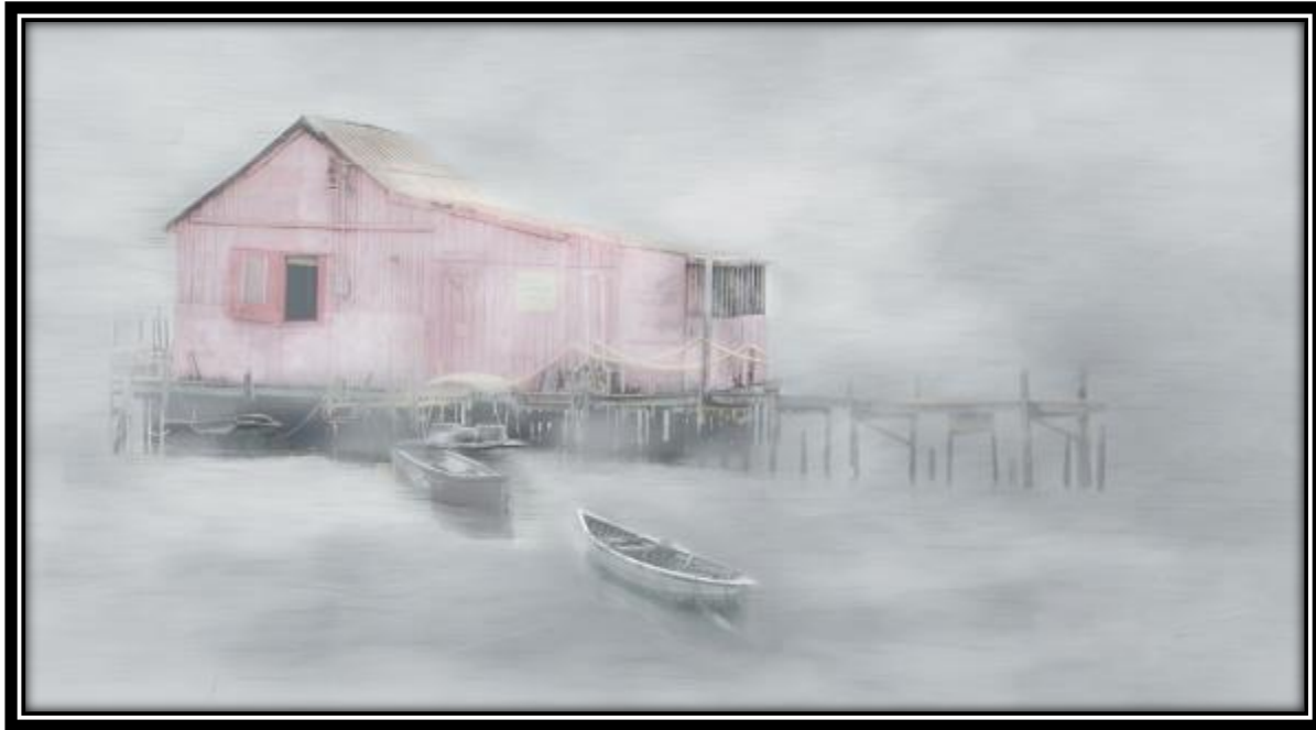
Open "Crabshack" 13

This is a moody photo that really works well in a panorama format. It strikes me as a little flat so that a slight bump on the saturation slider might brighten up the color of the building.