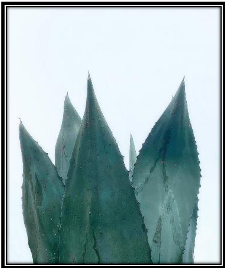
Advanced "Century Plant" 15

The Century Plant is an excellent high key image. It's well exposed and pin sharp while maintaining a very white background. The variation of lighting on the leaves is attractive. I wonder what it would look like as a monochrome.