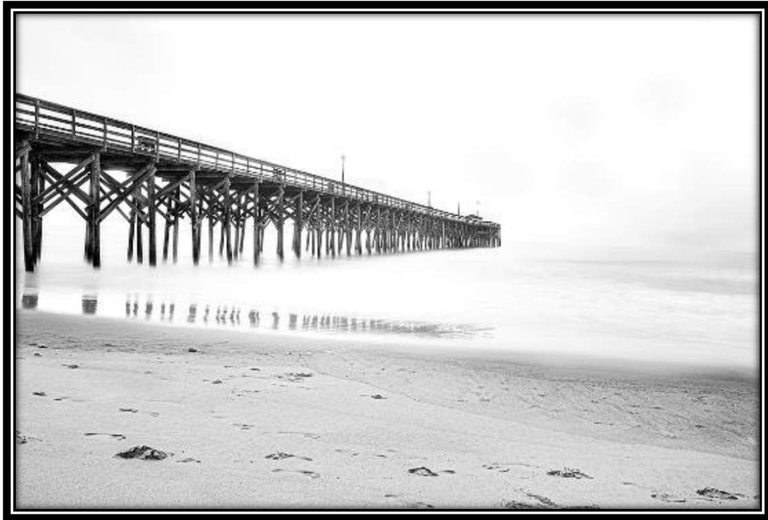
Intermediate "Pawleys Pier"