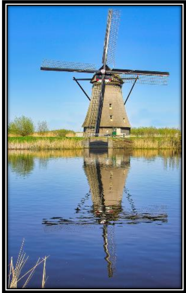
Open "Windmill Reflection"