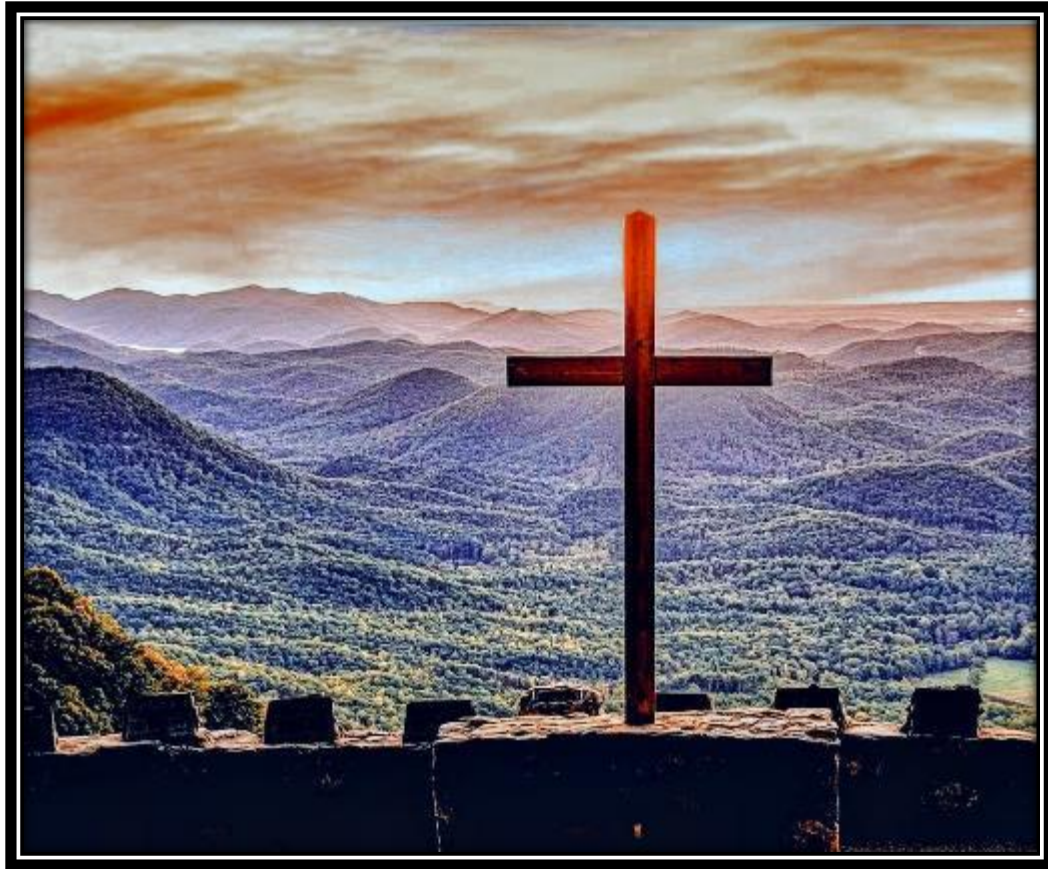
Open "Peaceful Reflection"