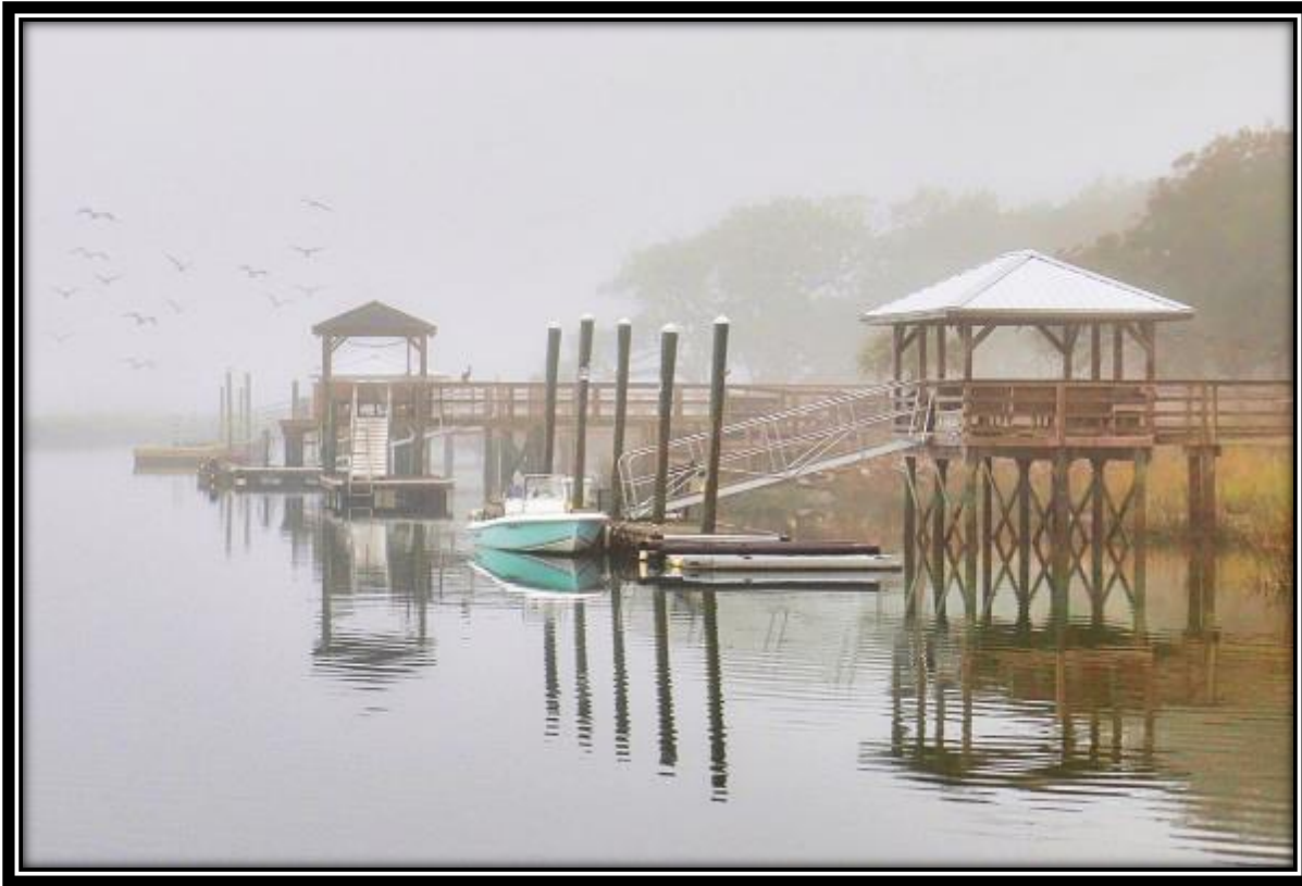
Open "Turquoise in the Mist"