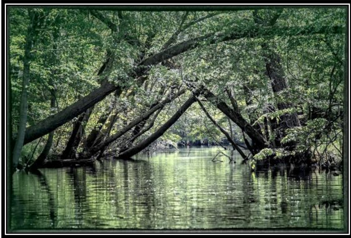
Open "Marsh Opening"