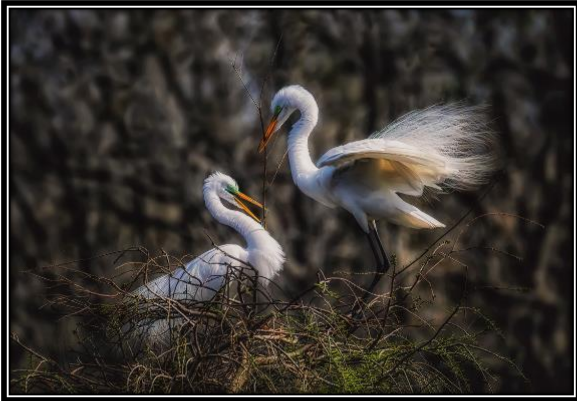
Open "Love Nest" 15

The focus in this image really helps tell the story. The blur in the background is just right, and the foreground and birds are perfect. The exposure is right on - all you needed was the right moment. Hang it up!