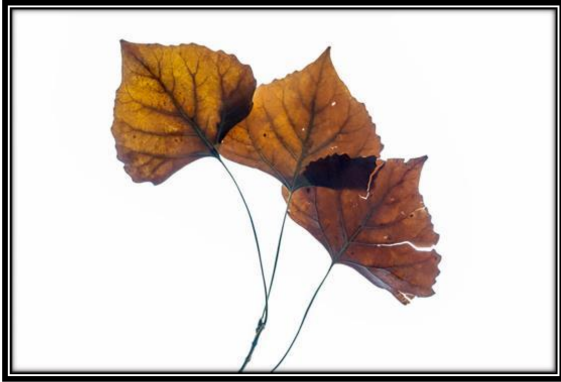
Open "3 Leaves" 12

This assembly of leaves is thoughtful and an example of high key. It's simple and works fairly well accept that it's not sharp. It's not so far off that a sharpening program might help, but as is, it is an interesting effort that just misses.