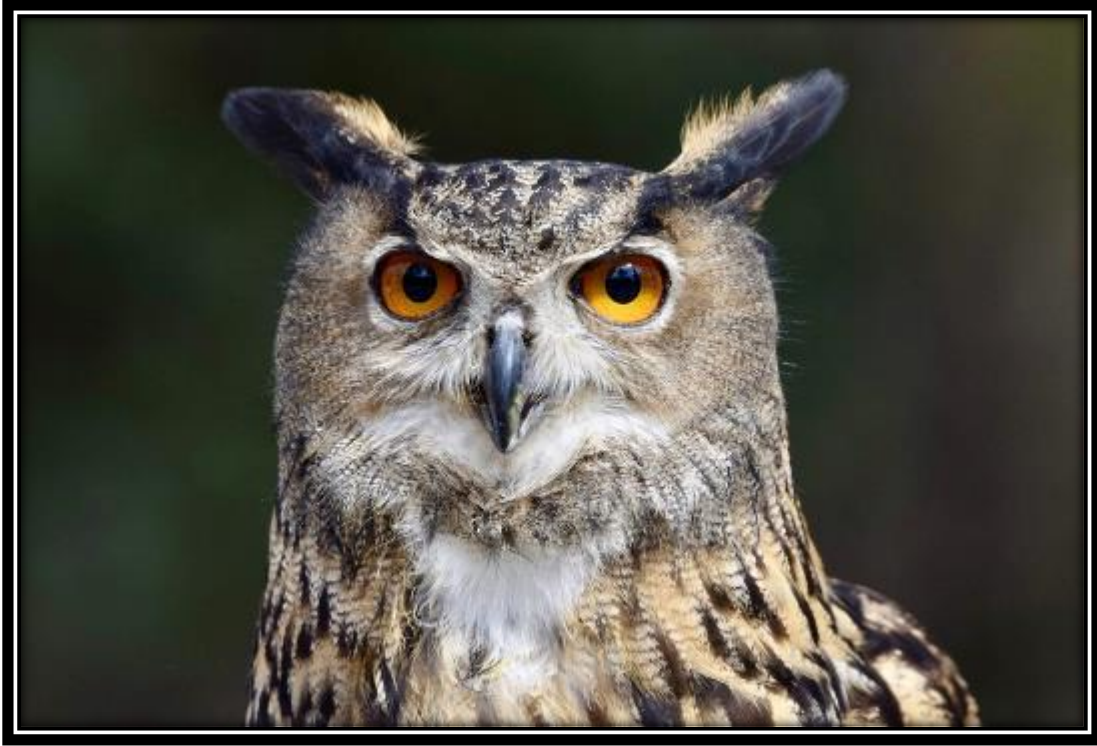
Open "Eagle Owl" 13

This owl is a striking image. The tight crop is very effective. It appears that the image was overly sharpened, or perhaps it has been run through a filter program. It's interesting either way.