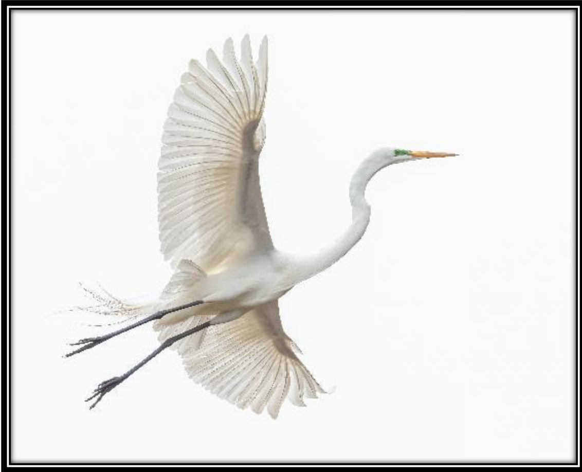
Intermediate "Great White Egret"