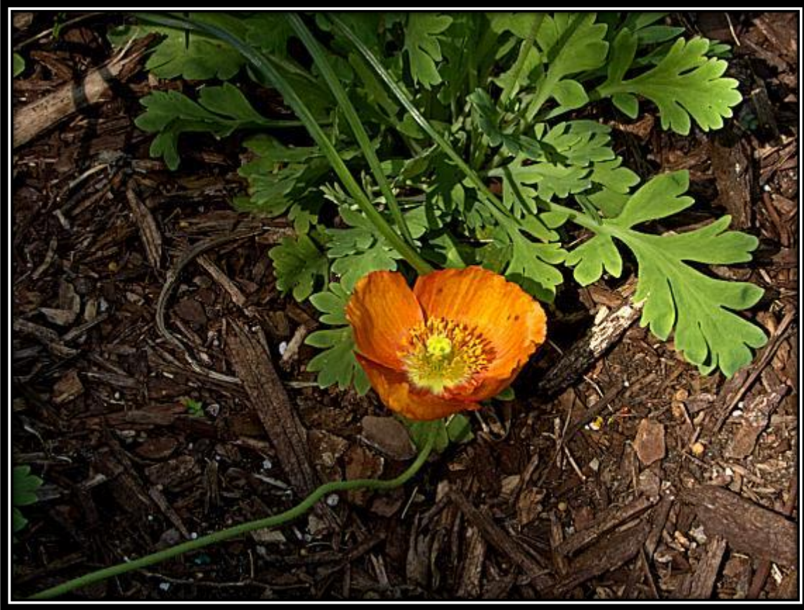
Open "Spring" 13

This is an original composition that actually works pretty well. The exposure appears to be correct - it's just that the focus is a little off. More poppies are coming so do it again with a tripod and nail the focus.