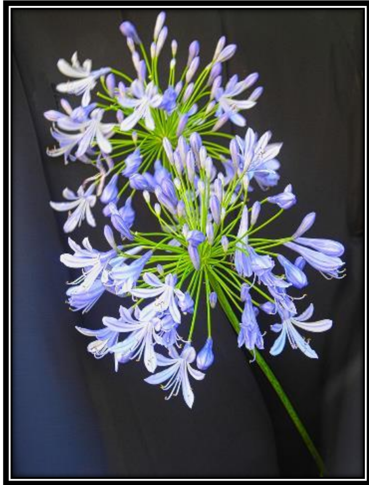
Open "Egyptain Lily"