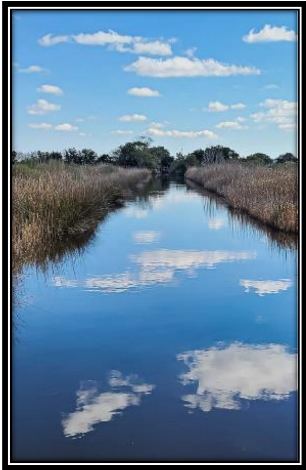
Open "Rice Fields Reflection"