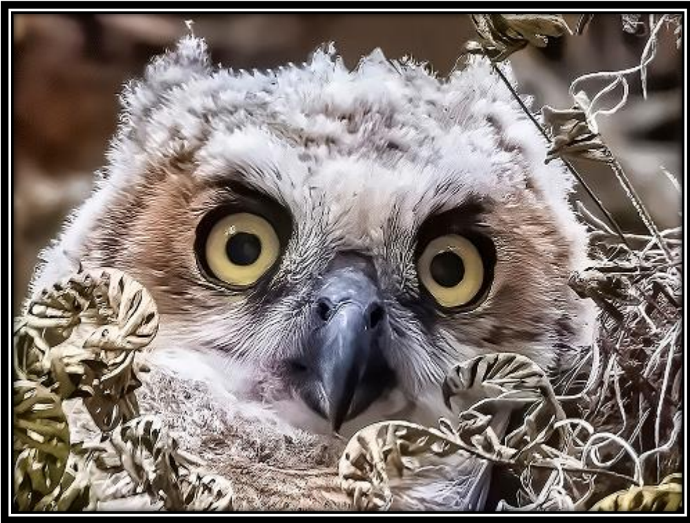
Open "Baby Owl Eyes" 15

The owl portrait is very well done. It is sharp, well exposed, and a real attention grabber. I can't think of any suggestion for improvement.