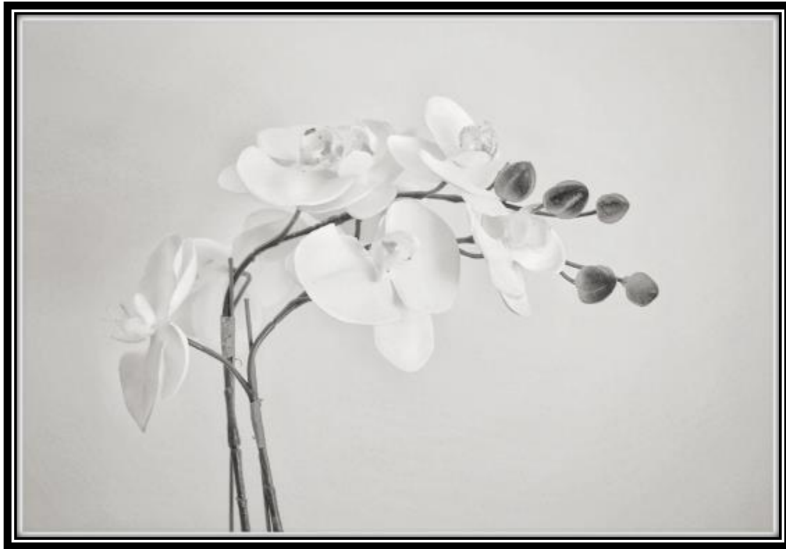
Intermediate "White Orchids"