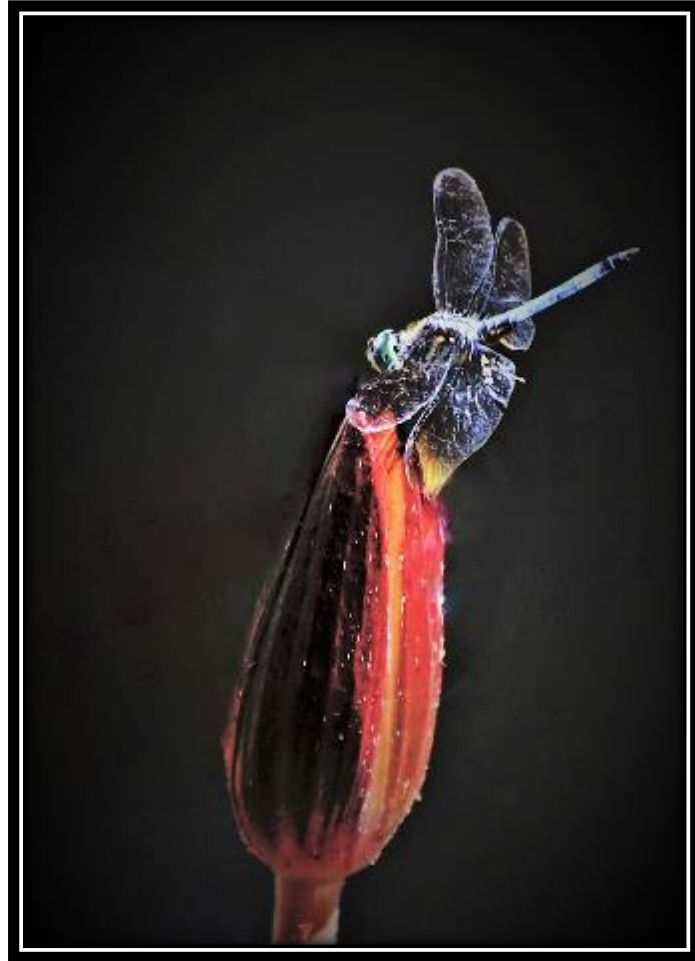
Open "Dragonfly on Pod"