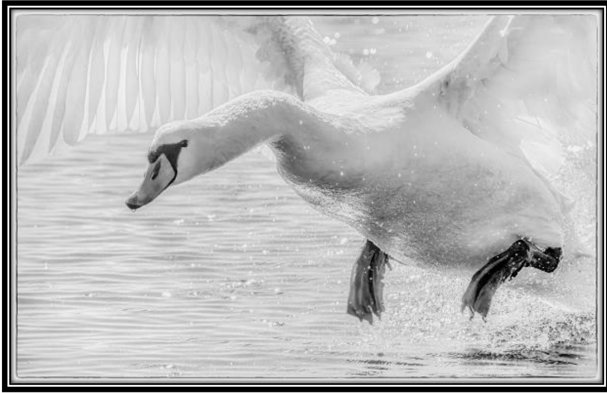
Intermediate "Swan Air"