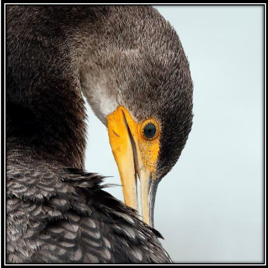
Open "Preening Cormorant"