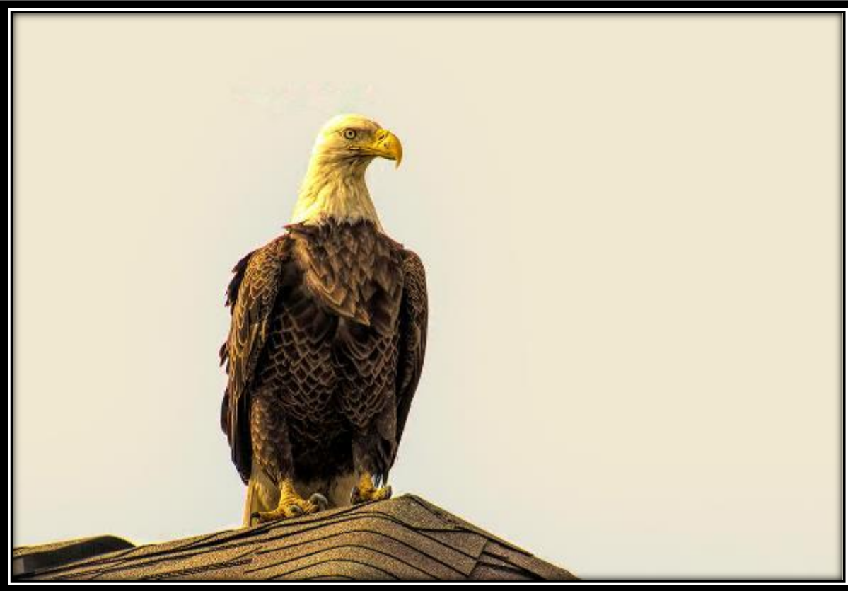
Advanced "The Hunting Eagle"