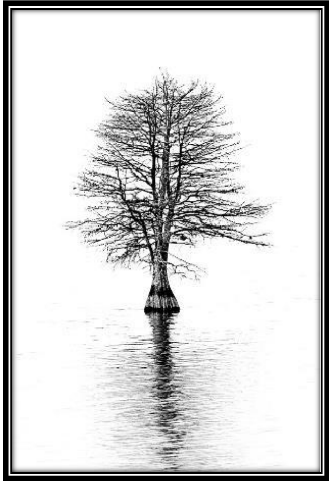
Open "The Lone Cypress Tree"