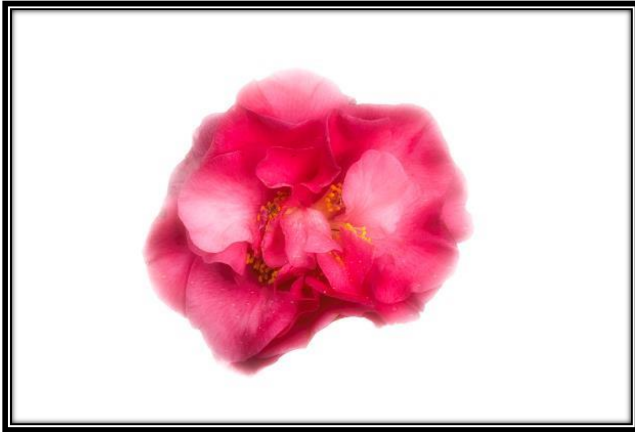
Intermediate "High Key Flower"